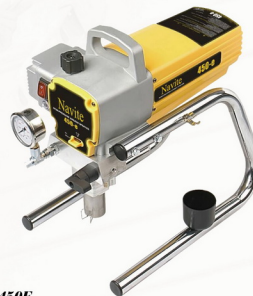
■ NA450E Machinery pressure control system