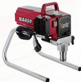
■ NA450 Electronic pressure control system